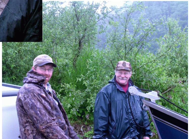
Certified witnesses to all the events.