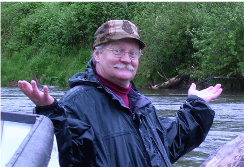
“Do pictures lie?