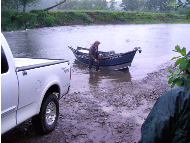
Takin out. Good memories.